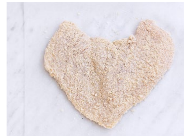
FINE WHITE CRUMB