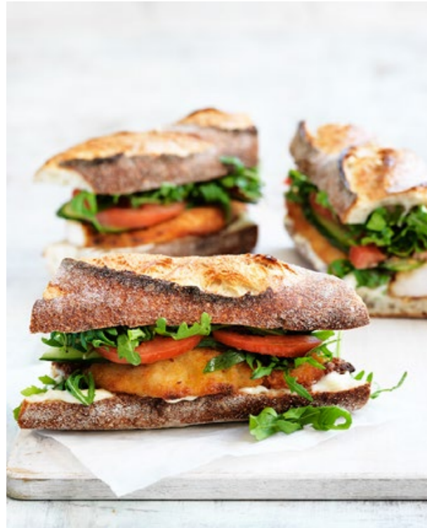
COOKED BREAST SCHNITZEL

Juicy chicken breast & thigh fillet full muscle pieces coated in a delicate crumb and slow cooked to golden perfection. Serve with a side of chips & salad or us to build the perfect sandwich.