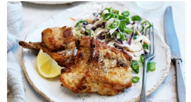
SOUTHERN STYLE NINE CUT

PACK SIZE 5KG CARTON SHELF LIFE 12 MONTHS