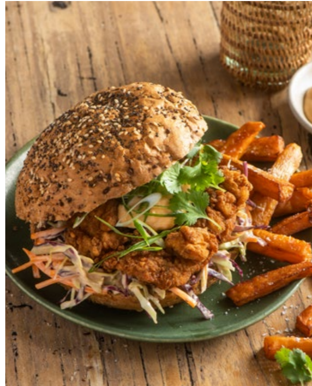
COOKED BREAST SCHNITZEL SOUTHERN STYLE

UNIT SIZE PACK SIZE SHELF LIFE 160G 30 P/BOX 12 MONTHS