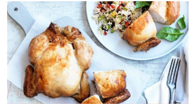
WHOLE CHICKEN OVEN ROAST

Size 12 Whole bird roasted, packed and ready to heat & serve.