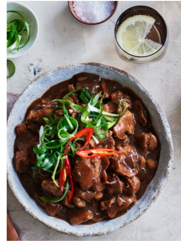
CHINESE BRAISED CHICKEN

Thigh fillet sautéed in brown sugar, garlic, ginger, onion and chilli finished with a Chinese cooking wine infused stock.